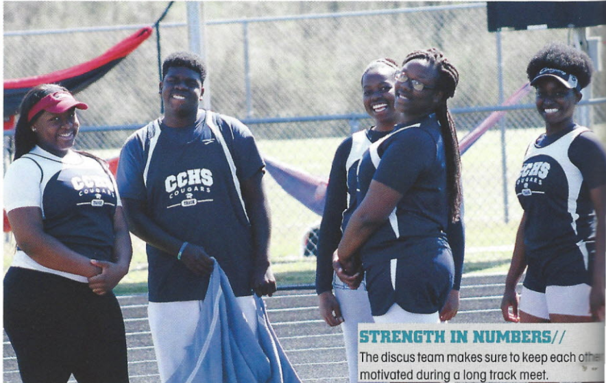
STRENGTH IN NUMBERS// The discus team makes sure to keep each other motivated during a long track meet.