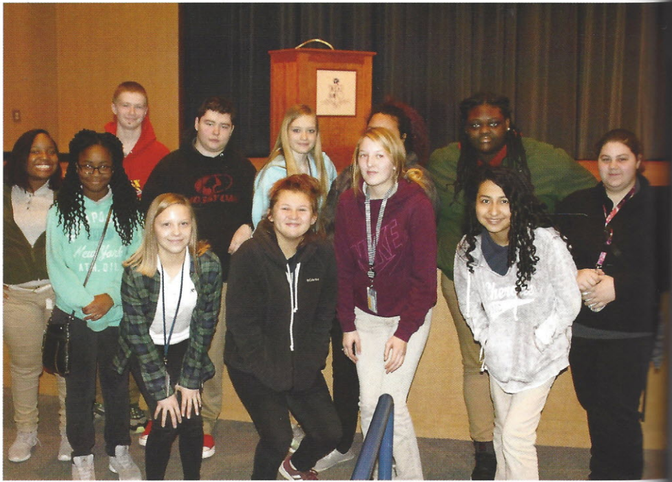
Low Country Area Health Education Center (AHEC) has teamed up with HCA to provide a direct community connection to health care careers. The students in this picture are the first group to have completed the first module for AHEC content. Congratulations!