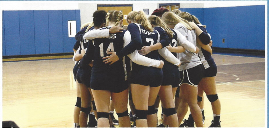
A tradition that our JV volleyball have withheld all season is that before every game they come together and pray for good luck and no injuries.

Our JV Volleyball girls worked exceptionally hard this season. Their final season record was 8-8. Their success can in part be contributed to the strong and lasting bonds the team made. Making friends with your teammates is one of the keys to working together and having a successful season. This allows players to trust one another's decisions on the court and to accept help when needed. We are very proud of our Junior Varsity Lady Cougars this season! As they progress, we look forward to seeing them on the Varsity team and beyond!