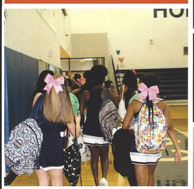
The girls start their confident walk to the field, ready to cheer on their counterpart football team.

The squad locks arms and discusses the techniques for new stunts the teams planning to perform.