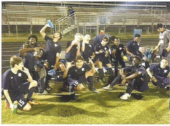
The Varsity Boys Soccer team shows off their excitement on the journey they have had this season, while much more excitement is soon to come next season.

Rules: #1 If it moves, kick it. #2 If it doesn't move, kick it until it moves.