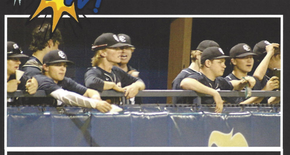
The Colleton County Varsity Cougars Baseball team show their cougar pride as they loudly cheer for their team members at their first game of the season.

Baseball is a good sport to help teens improve physical fitness and build lasting friendships. It also improves skills such as communication, team work, and problem solving. Baseball tends to help people feel confident and come out of their shells, as well as showing that success does not come from just one team member doing a good job, but from the team as a whole. The Colleton County High School Varsity Cougar Baseball team hopes to demonstrate all of these skills throughout the season.