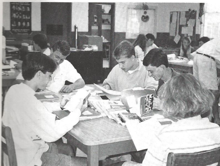
Seniors receive career counseling during the spring to better enable them to choose a college and a major.

Who belongs to these legs? Could it be the Senior football players dressed in cheerleading uniforms at one of many CPA pep-rallies?