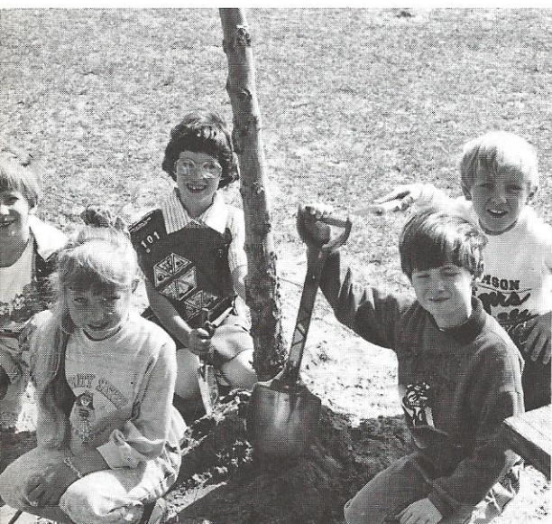
One of the activities lower school students participated in for Earth Day was planting a tree near the softball field.