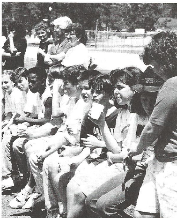
These fans get a good laugh as they watch the faculty play the student council in a softball game.