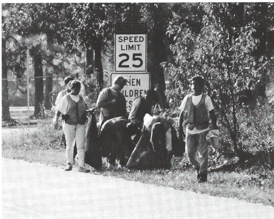
The club participates in the Adopt-a-Highway program by cleaning up the roads near Colleton Prep. These students spent Saturday morning helping with this community project.