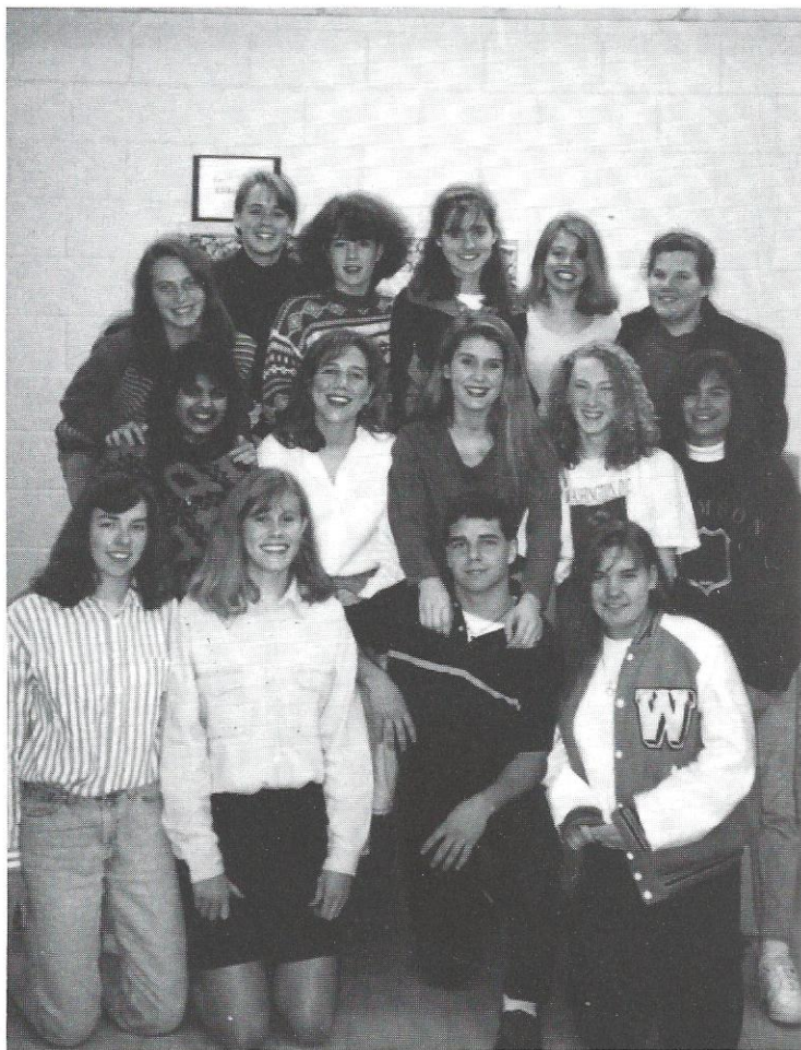
The 1993-94 yearbook editors include students in grades 10 through 12 who give up much of their time to work on the yearbook.