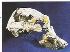
Institute of Human Origins

The century's greatest chemist and antinuclear activist, Linus C. Pauling, winner of the Nobel Prize for Chemistry in 1954 and the Nobel Peace Prize in 1962, dies at the age of 93. His work on DNA laid the foundation for Crick and Watson's discovery of the double helix.