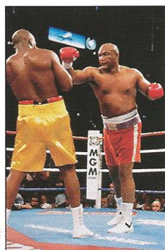
Focus on Sports

Whenever the Magic, led by 7'1" 300-pound Shaquille O'Neal, score 110 points, the Orlando McDonald's restaurants redeem home game tickets for a free Big Mac. With the team selling out all 16,000 seats, the Golden Arches supply a massive Mac attack, consoling fans for the lack of a playoff victory.