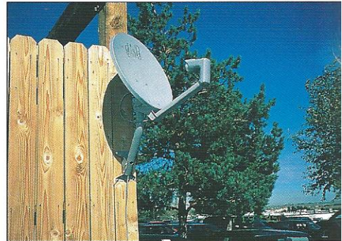
Echostar Communications Corp.

Satellite dishes become one of the year's hottest-selling electronic consumer products. Owners find the savings of not paying for cable services cover the cost within a few months.