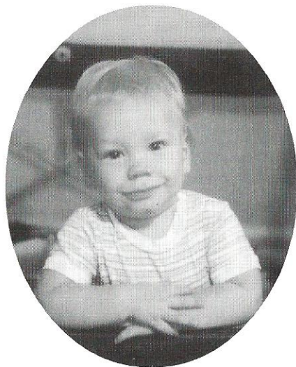
My Little B,

You are not only my little brother, you are my best friend. We have been through tears, laughs, heart-aches, and loves. And, through it all, we stood by each other. You have become a strong and caring young man. Remember that wherever life may take you, I will always be by your side! I am very proud of you and all of your hard earned accomplishments!