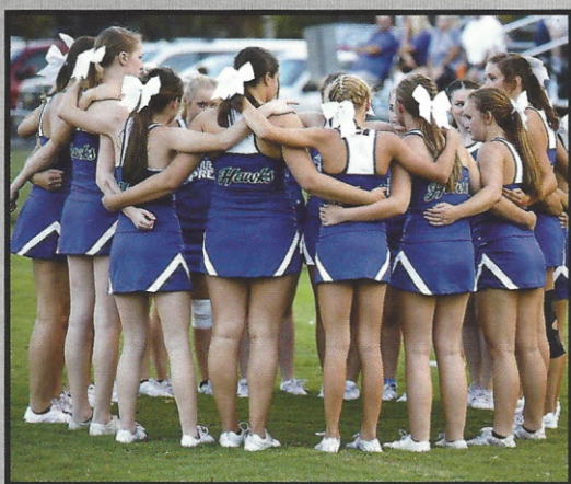
Above: The cheerleaders gather together to celebrate getting a touchdown at an away game.