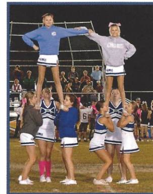
Above: The girls finish performing their half time routine they prepared for the game with a stunt and a smile. Pleased with the results and ready to cheer on the boys in the next half.

Having a small team was an advantage to these girls. The girls were all friends, but built their friendships up so they would have an unbreakable bond. When getting prepared for their Thursday night games the girls would spend time after school making sure everything was ready to go, so they could cheer