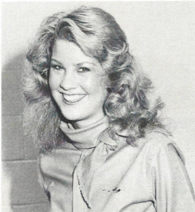
6. Now what have I gotta do?