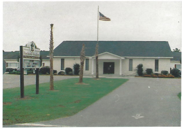
This is the place where it all starts.