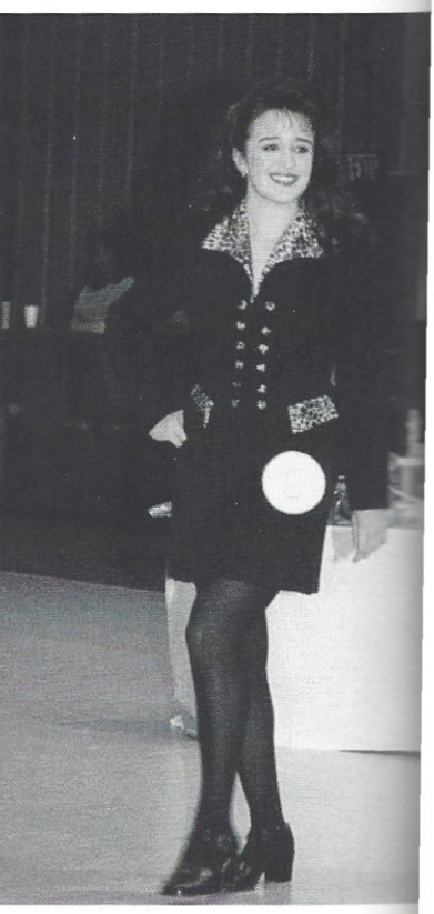
During the sportswear competition.