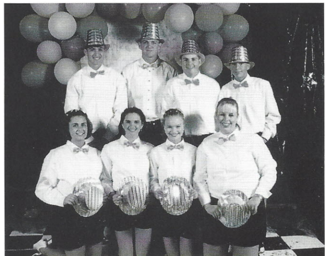
The 1999 Waiters and Waitresses