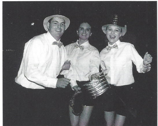
Hey, shouldn't you be doing something?