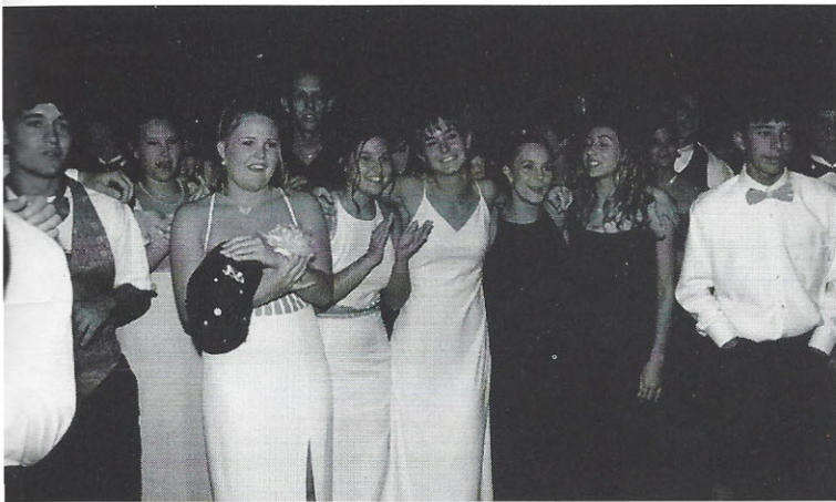
Seniors crowd around for the poem reading.