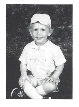
"It's a typical situation in these typical times, too many choices..." — Dave Matthews