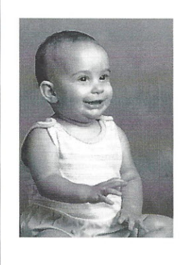
"The only wasted day is one without laughter." — E. E. Cummings