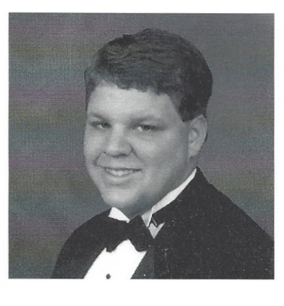
Everything is ok in the end. If it's not ok, it's not the end."