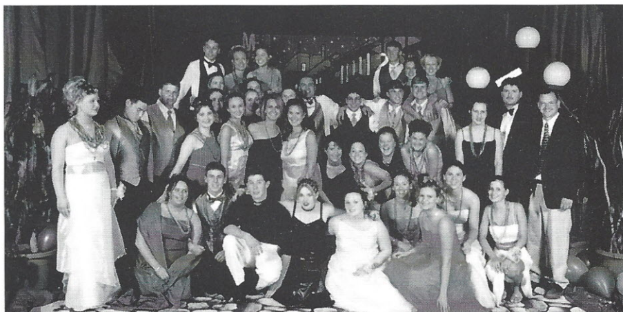
The Juniors are enjoying all the hard work that went into making Mardi Gras magical!