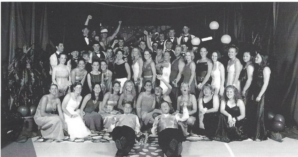
Seniors for 2001 live it up at the Mardi Gras bash!