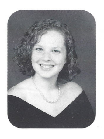
"Stand up for what you believe in even if you stand alone." - Unknown