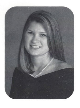
"Some of it's magic and some of it's tragic but I had a good life all the way." -Jimmy Buffett