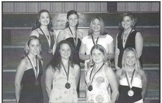
Members of the Class of 2006 take a break from studying to attend the 2004 Academic Banquet.