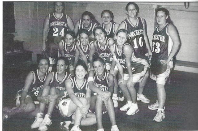
The Varsity Girls Basketball team celebrates their first victory to kick off a fun season.