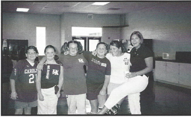
Doesn't this group of girls look thrilled about being at school?