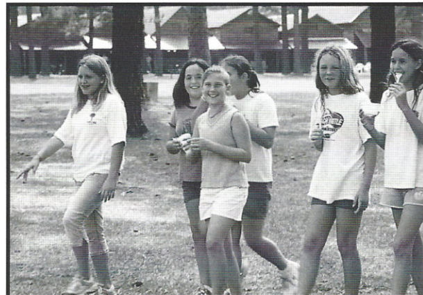
Campmeeting is a great place to go after school hang out with your friends!