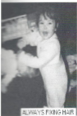
ALWAYS FIXING HAIR