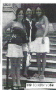
TRIP TO NEW YORK