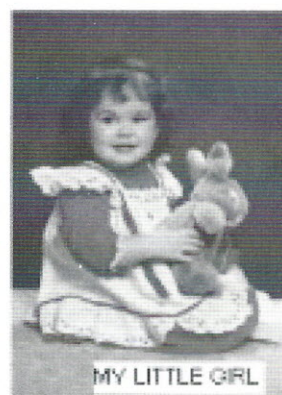
MY LITTLE GIRL