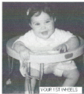
YOUR 1ST WHEELS