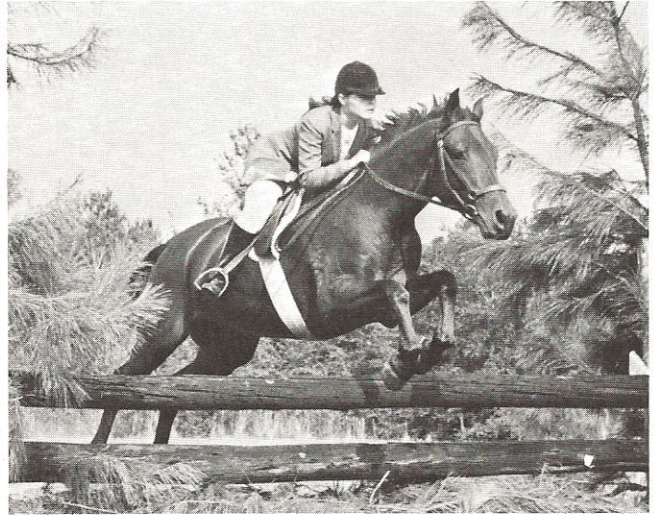
Emmie Haynes takes a jump in flying style