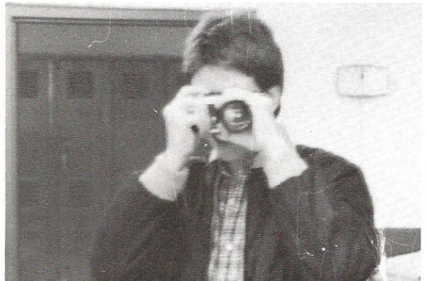
(Above), Photographer Bruce Hensely has magical powers of being 20 places at once to take pictures. Somehow we found him!