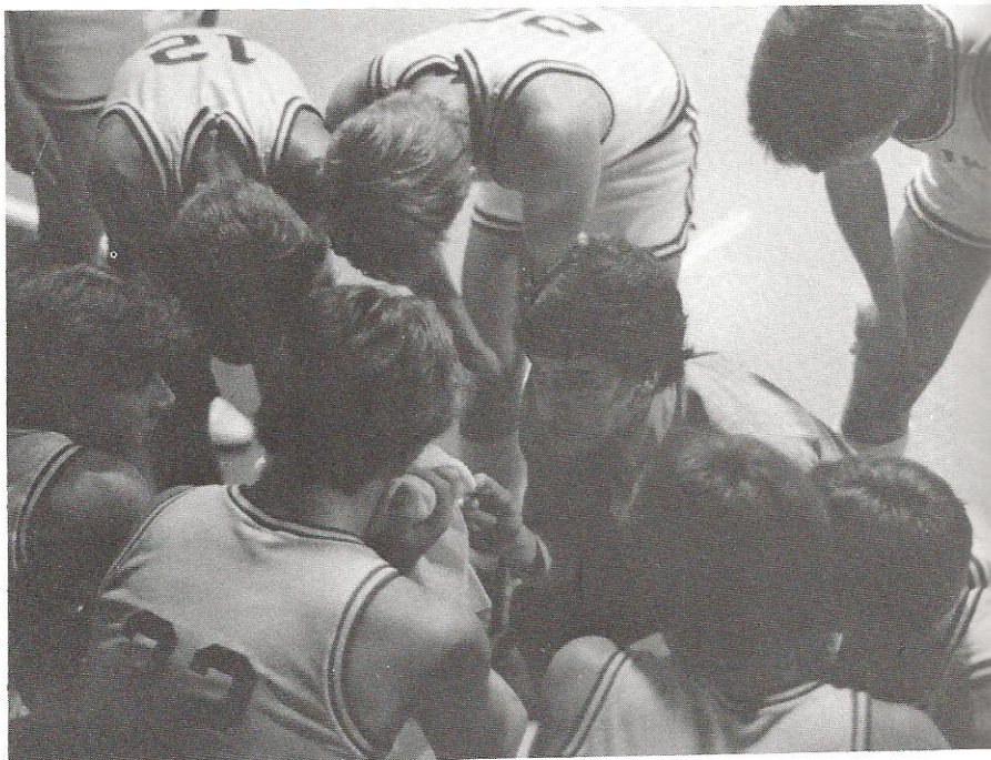
The players listen intently as the coach tells the game plan.