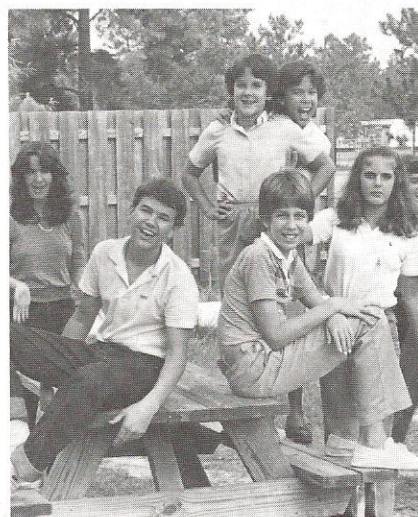
(Above) For these 7th graders, recess is spent at the picnic table.