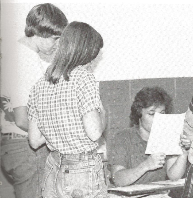
These seniors decide to use their study hall for a change.

T he seniors were surveyed in different facets of their life. Fifty-three percent of the seniors were able to take time out of their busy schedule to work. Forty-seven percent aren't employed.