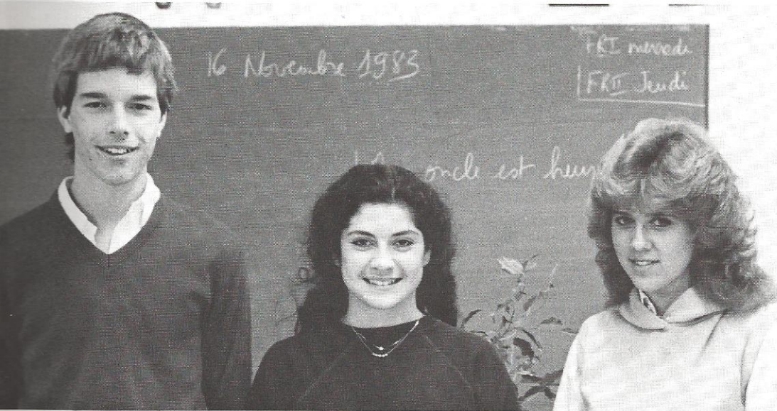
(Left) French Club meetings aren't all work and no play!