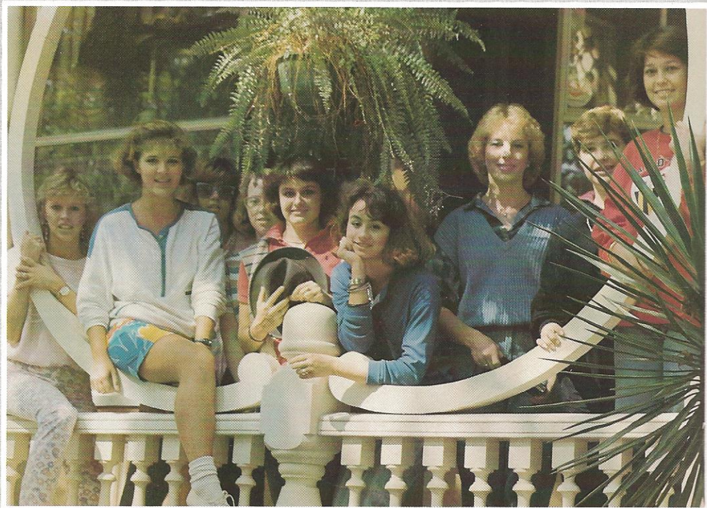
The Senior girls pose on the porch of the Gingerbread House in Savannah.