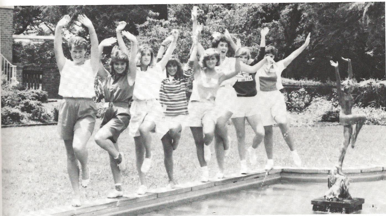
What a line-up! Part of the Talon Staff poses in front of the fountain at Converse College.