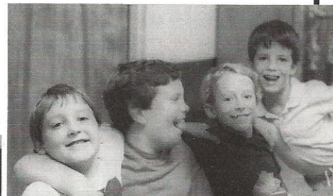
The four musketeers? No, just four rowdy third graders living it up in the canteen.