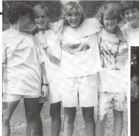
These seventh graders find P.E. is much more exciting when they share the fun. Not a bad way to spend sixth period, either!