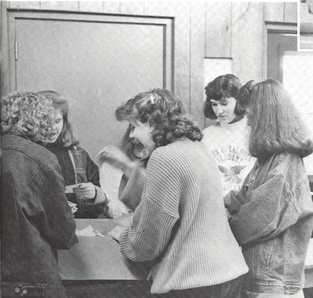
Look at this one! These staff members sort through this box in search of pictures which the editors may be able to use.