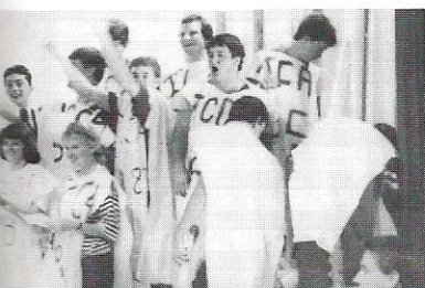
The senior class show their school spirit as they perform their Homecoming skit as the "Spirit Ribbon Choir."