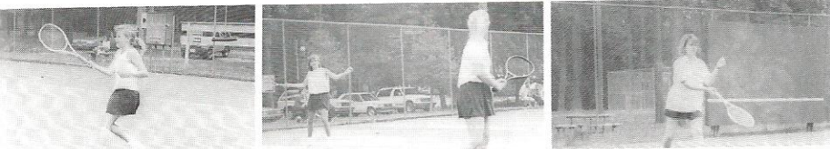
Members of the Girls Tennis Team practice at Forest Hills Courts.