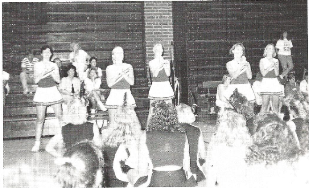
Dance has affected every aspect of high school life. Even cheerleaders are required to have dance ability as shown by our Varsity Squad during camp.