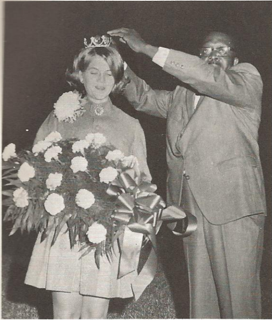
The happiness, spirit, and surprise of Homecoming and Victory.