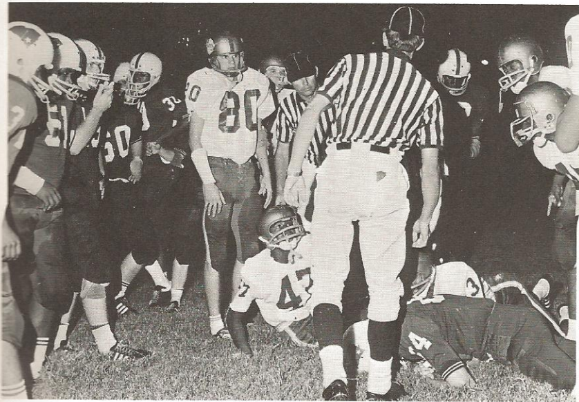
The Hope and Anxiety of the First Down.