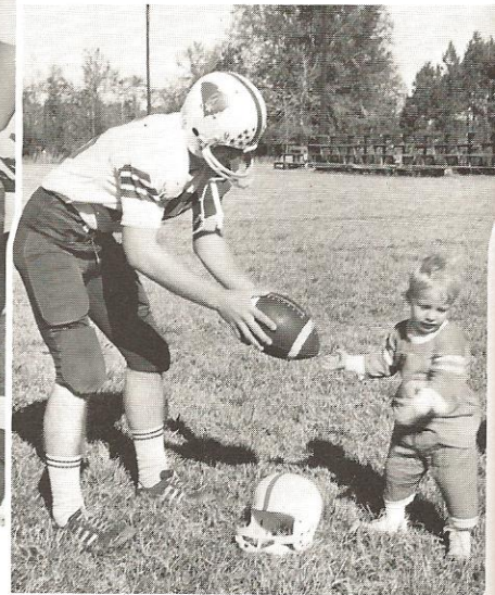
The Youth awaiting the opportunity to move into graduate's positions as this young Patriot apparently is saying, "I don't care who you are, give me the ball."