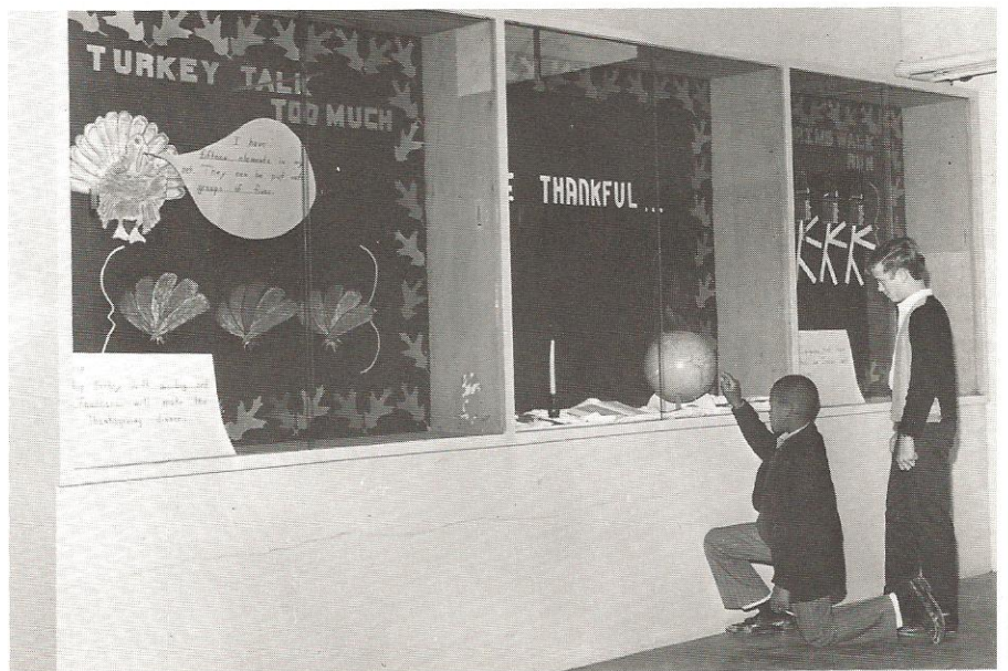
Two Students observe the Thanksgiving Bulletin Board, and discuss the history of Thanksgiving.