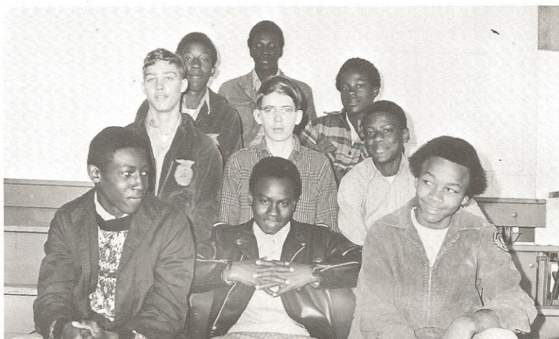
FIRST YEAR MEMBERS