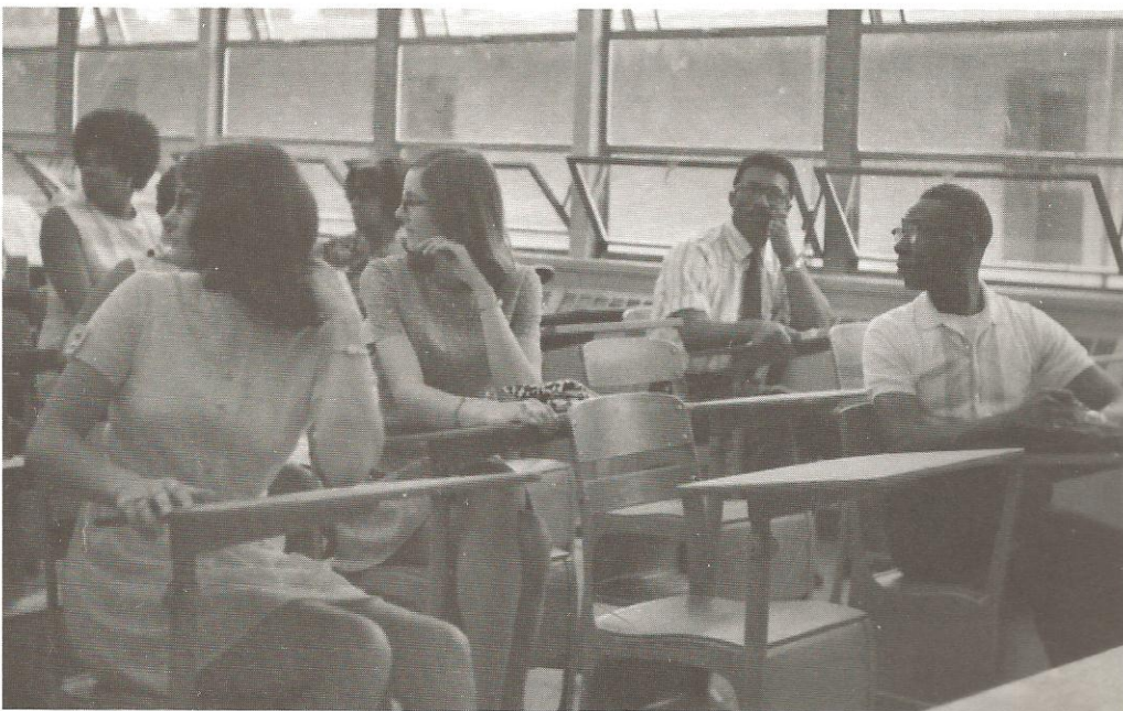
"I wonder what they're all looking at?"