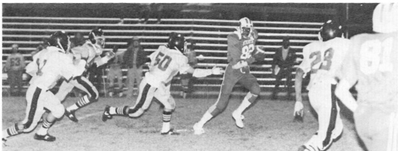
You can't catch me, I'm a wide receiver.