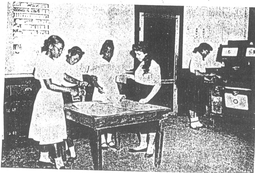
"We learn to do by doing." These girls are preparing an adequate balanced diet. The correct use of time, skill, method and cooperation is practiced.