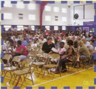
Parents & students anxiously wait to get schedules & meet teachers.