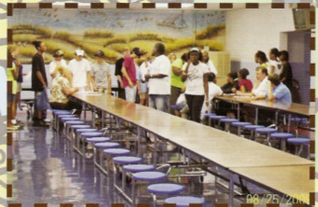
Parents of 8th grade students, our seniors, wait in line to get their child's schedule in the cafeteria.