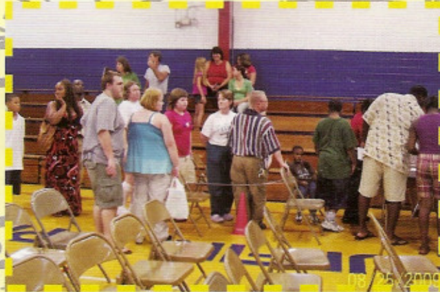
Parents of 6th grade students wait in line to get schedules & other information.