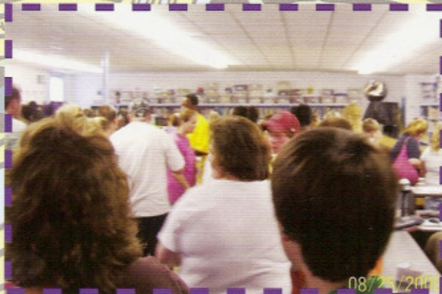
Parents of 7th grade students pack the Media Center in order to get their child's schedule.