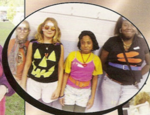
Tacky, tacky 8th grade girls!