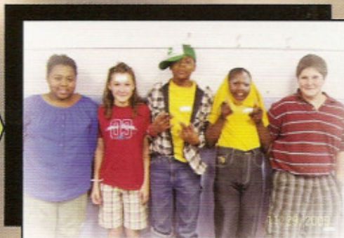
The 7th grade isn't letting the 8th grade be more tacky than them!