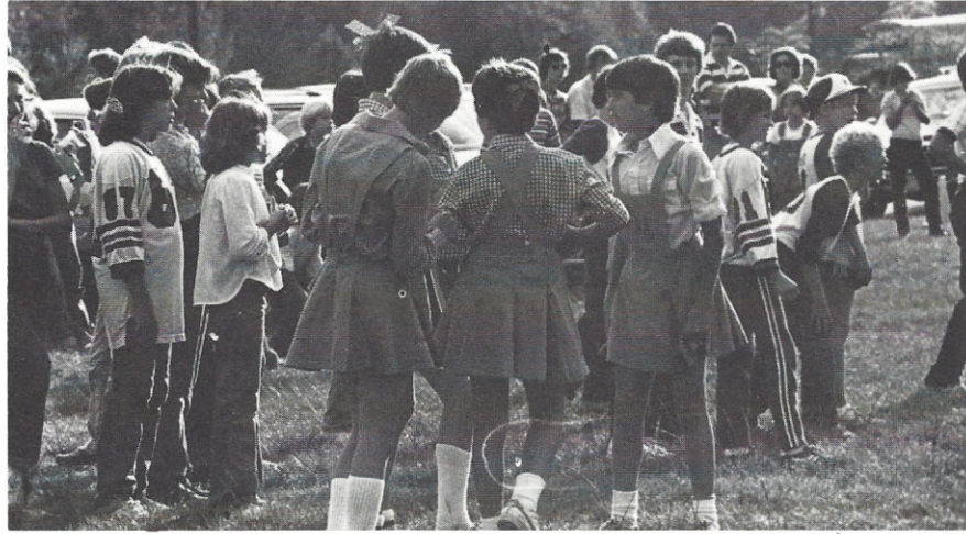
1. Powder Puff cheerleaders discuss a chant before cheering their team to victory.