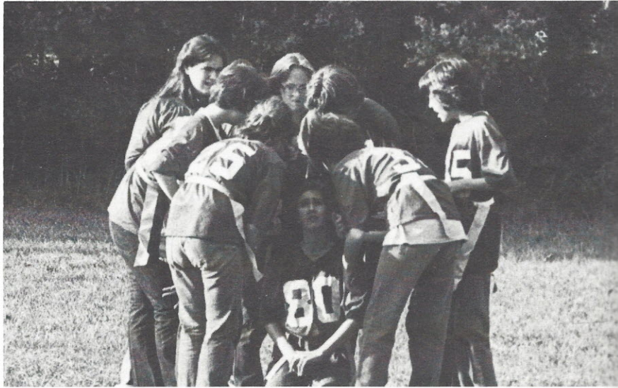
1. Between quarters, the Powder Puff seventh grade team plans its strategy.